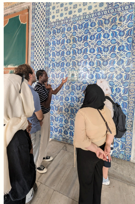
ART HISTORY STUDENTS IN ISTANBUL